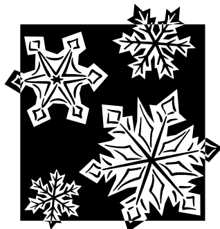
Season's Greetings from OCRA™

Another way to reduce the expenses involved in processing claims is the electronic transfer of the reimbursement of your claim to your bank account, with an explanation of the payment sent via email by Sun Life. For more information, check the Sun Life website www.sunlife.ca or call 1-800-361-6212